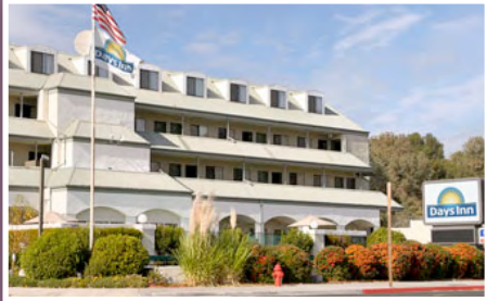
Days Inn Oakhurst, California $4,995,000